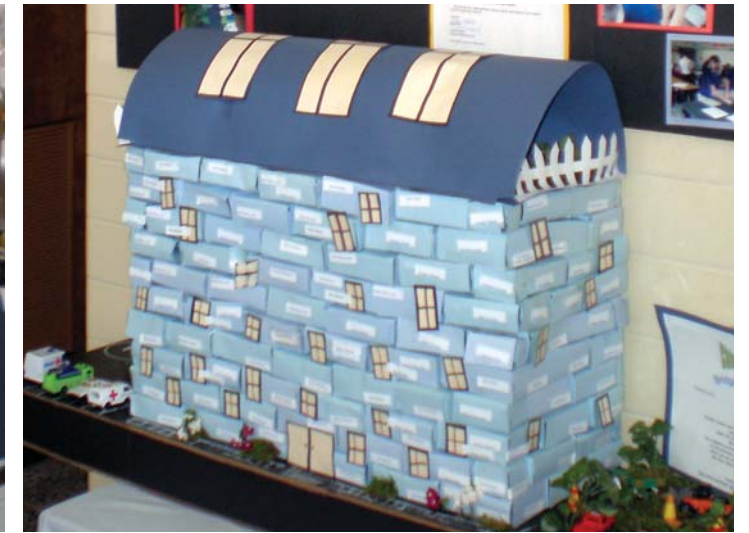
... and the finished product!

efforts of the missionaries who work with the disadvantaged families of Chimbote, Peru. The students have planned a number of activities which include bake sales and non-uniform day collections, a fund raising marathon sponsored by the Cross Country Team, Read for Chimbote which will involve collecting pledges for books read by the students throughout the year, a Sharing is Caring collection in the school cafeteria, and a Used Book Sale. Though no specific dollar goal has been set, the students have already raised almost $4,000 for the Chimbote Foundation with three months to go! Among the highlights of the Year for Chimbote was the kick-off assembly