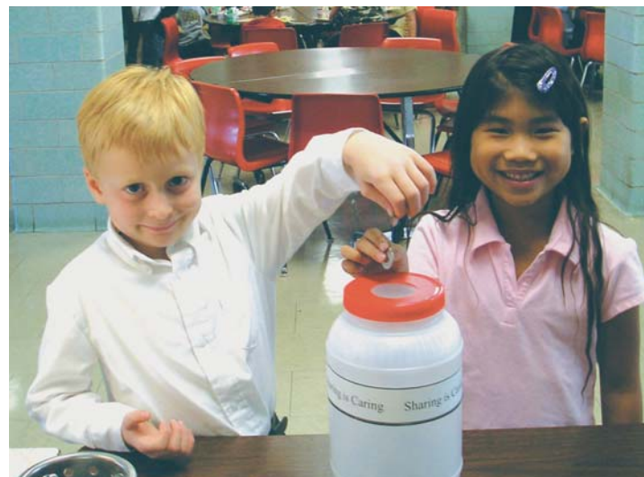
Children at Saint Elizabeth of Hungary giving money to Chimbote.