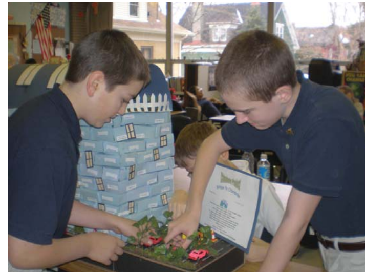
Students at Saint Cyril of Alexandria assemble their model ...

Saint Elizabeth Elementary School, located in Pleasant Hills for 65 years, has long demonstrated an untiring commitment to philanthropy. Central to its mission and educational program, Saint Elizabeth School teaches the importance of caring for others. Echoing the call to "Light the Way," this year Saint Elizabeth's efforts extend to the responsibility of being global citizens. A yearlong service project focusing on the mission in Chimbote, Peru was launched in August 2007 and will continue until May 2008. The money raised will support the medical and educational