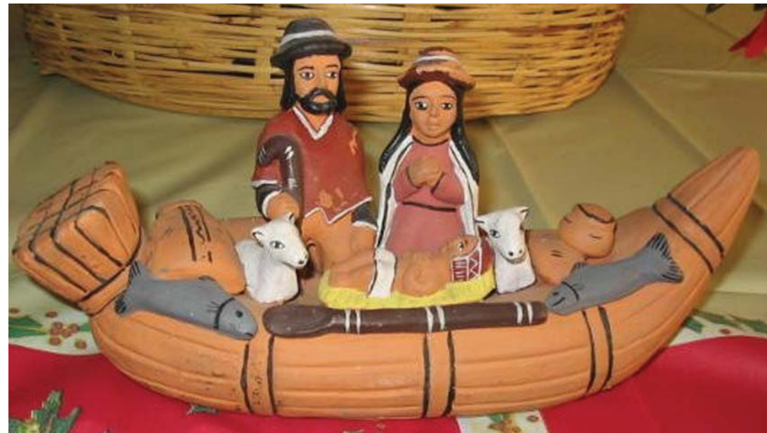
THE HOLY FAMILY: A Peruvian nativity scene, with the Holy Family in a reed boat like those used on Lake Titicaca in Peru.

life on the water and the use of boats is important. You can also notice that their clothes are distinctly Peruvian, as well as their hair and skin color.