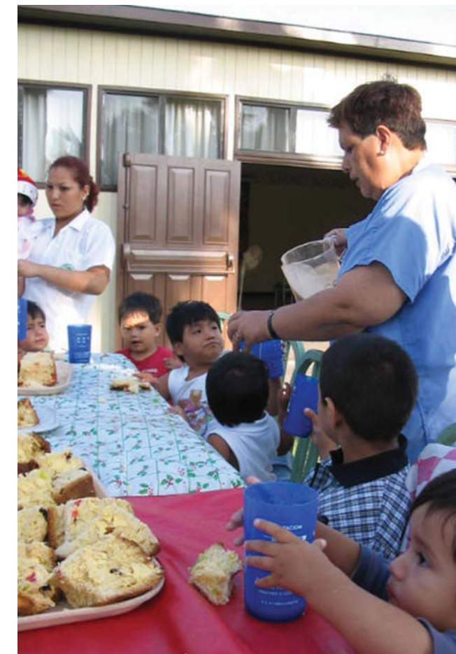
A CHRISTMAS TREAT: Children, below, eat panetón, a traditional Peruvian Christmas food, and have a traditional chocolate drink.

The simple celebration involved singing a few songs and reading a passage from the nativity narratives of the Gospels. Although it is simple, I found it really helped me to prepare my heart and mind for the arrival of the Baby Jesus.